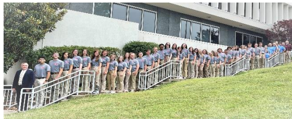
Tennessee Farm Bureau Headquarters