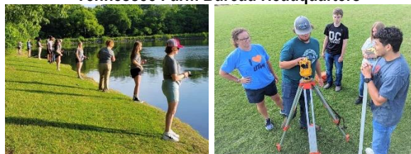
Fishing at Middle TN UT Ag Research Institute of AG