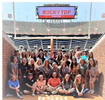
Tour of Neyland Stadium & Locker Room Vet Science working goats